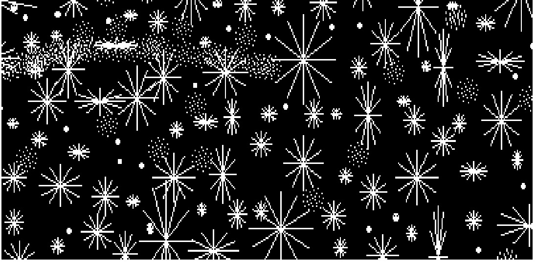
"Then He brought him outside and said, 'Look now toward heaven, and count the stars if you are able to number them.' And He said to him, 'So shall your descendants be.' " GENESIS 15:5